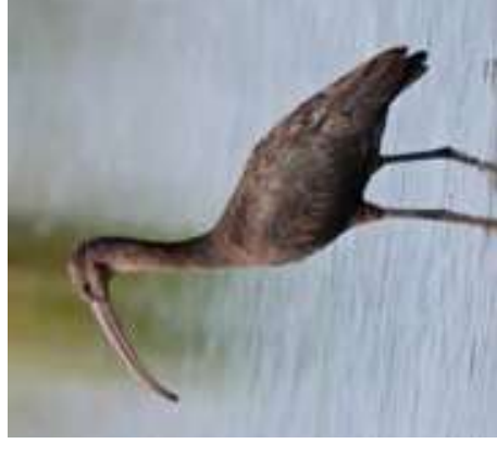
Glossy Ibis ( Plegadis falcinellus )

How to get there: on the road that leads to Faro Island, park the car before the bridge over the Ria Formosa. There is a road to the right leading to the interior of