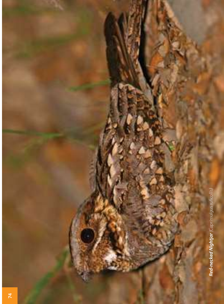
Red-necked Nightjar ( Caprimulgus ruficollis )