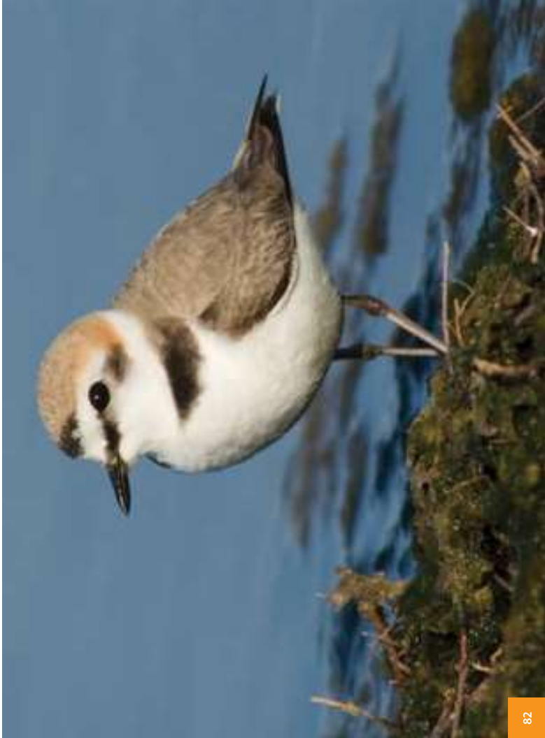
Kentish Plover ( Charadrius alexandrinus )

Signs and other aids: the trail is marked with signposts and information panels about the local birdlife.